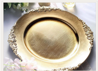
VINTAGE GOLD CHARGER